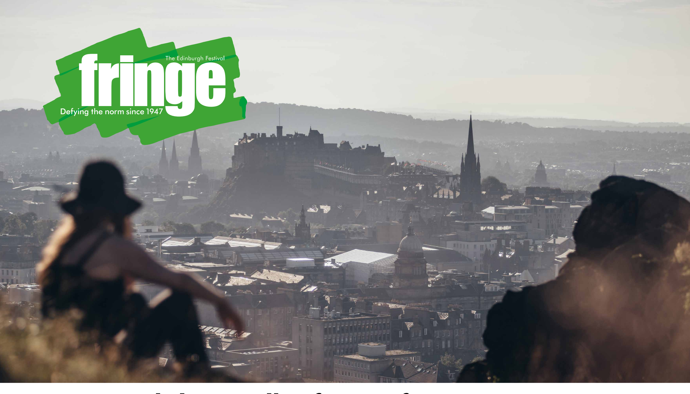
Sustainability toolkit for performing companies